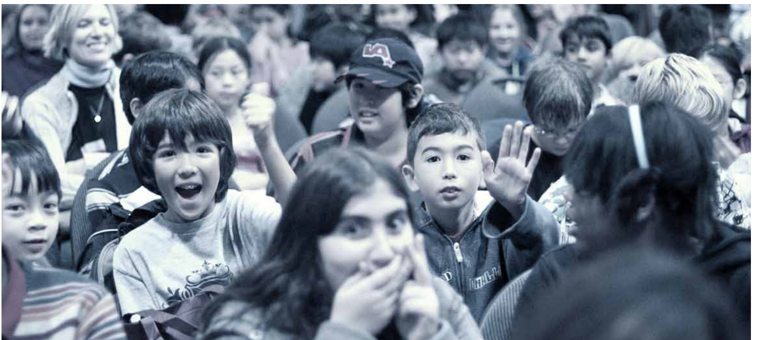
Students at a Festival event with Gordon Korman.

A record number of school groups also attended the Festival’s first three days, with 91 different schools from the Lower Mainland, Squamish and Vancouver Island coming to see authors talking about writing and reading in both French and English.